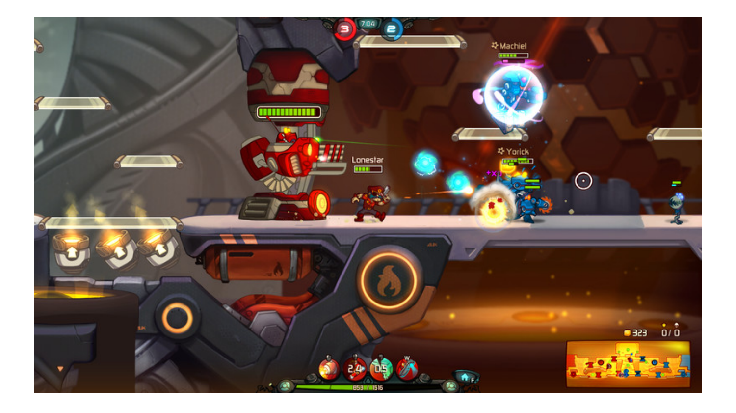
Heroes Of The Monkey Tavern Download For Pc [Patch]

Download >>> <a href="http://bit.ly/2NQO0TU">http://bit.ly/2NQO0TU</a>